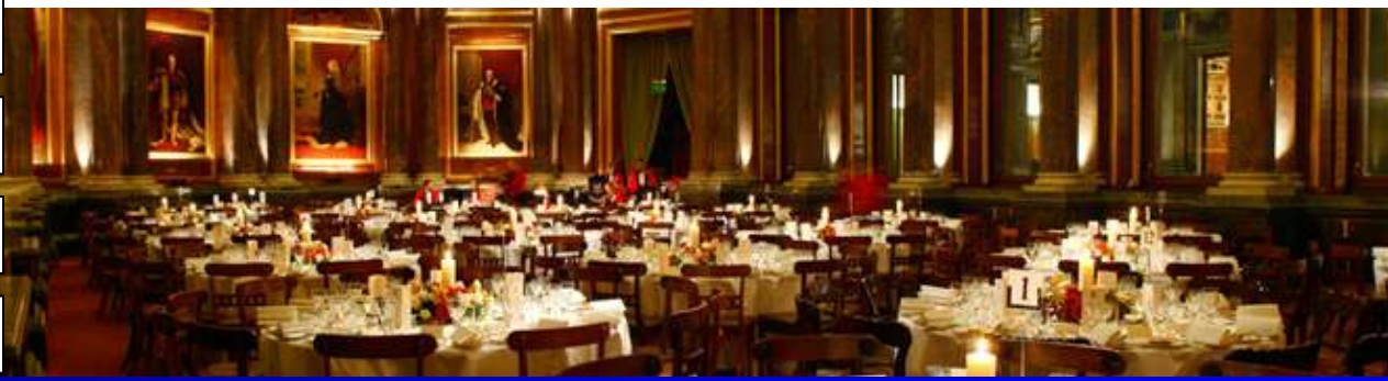
A wealth of venues