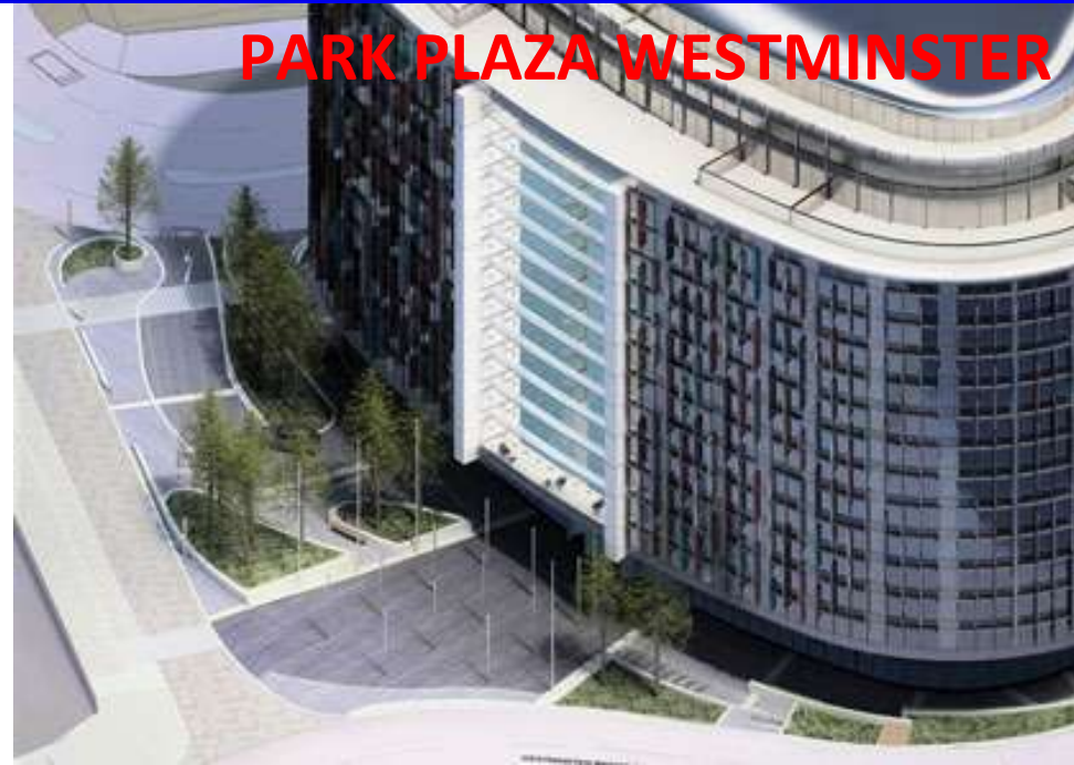
PARK PLAZA WESTMINSTER